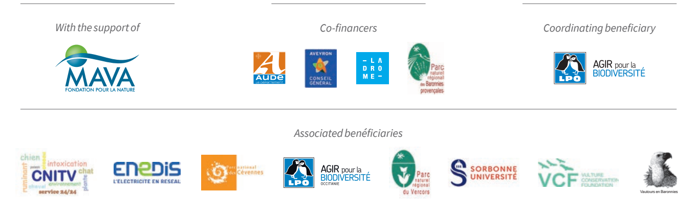
Service Éditions LPO n°ED2110010AB